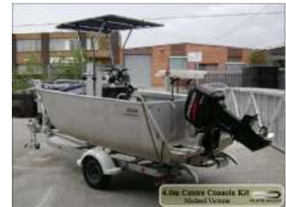
ACTUAL KIT MIGHT DIFFER FROM PICTURES SHOWN